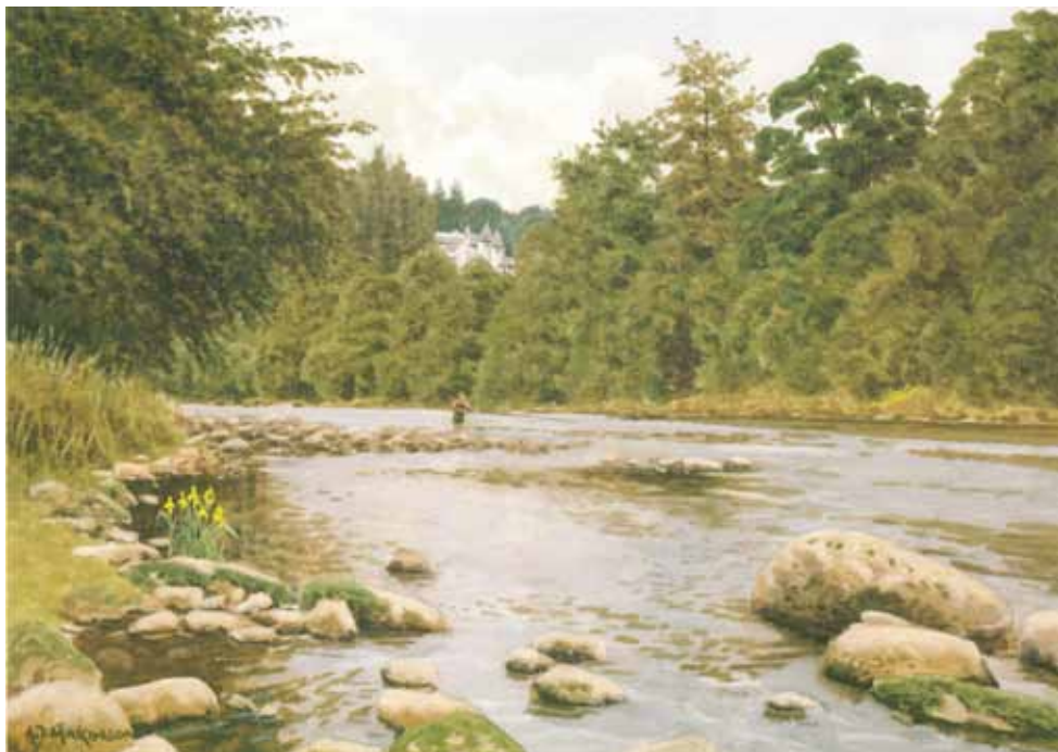
River Tay at Derculich

In aid of the River Tay Spring Salmon Restoration Appeal and Tay Foundation Projects.